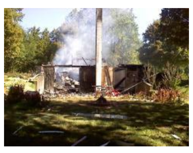
After the fire: The arson at the Stutte home resulted in a total loss.